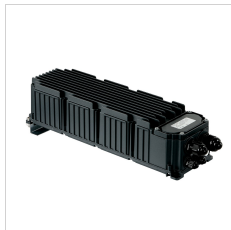
3109421 Driver box 1500 - 1,4 A - 3 CH - DALI